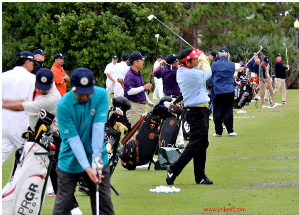
Players at the 2009 JNII Tournament of Champions warm up before their final round of competition at The Bear's Club under the watchful eyes of their team captains and professional caddies.