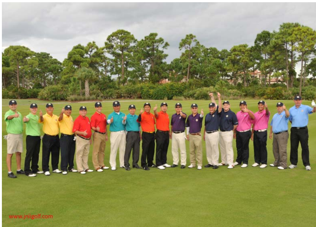
Golfers from around the world and all walks of life comprised the nine team field that competed in the 2009 JNII Tournament of Champions .